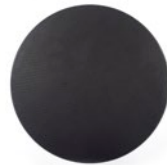
black grill (option)